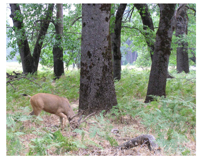
Fig. 1 – Mature black oaks and a lack of young oaks near the visitor center in Yosemite Valley. The mule deer in the foreground is foraging for acorns and oak seedlings (W.J. Ripple, September 2006).

Cougar were displaced from Yosemite Valley early in the 20th century and a deer population irruption followed in the 1920s (Wright et al., 1933; Dixon, 1934a). Thus, we undertook this study to evaluate any effects on the current age structure of black oak as mediated through potentially high levels of deer browsing. We hypothesized that any long-term gap in black oak recruitment is mainly associated with low density of predators and high browsing pressure by mule deer (see Fig. 1). We also considered alternative hypotheses for any reductions in black oak recruitment including: (1) fluctuations in climate, (2) lack of fires, (3) conifer invasion, (4) land use, and (5) loss of aboriginal influences.