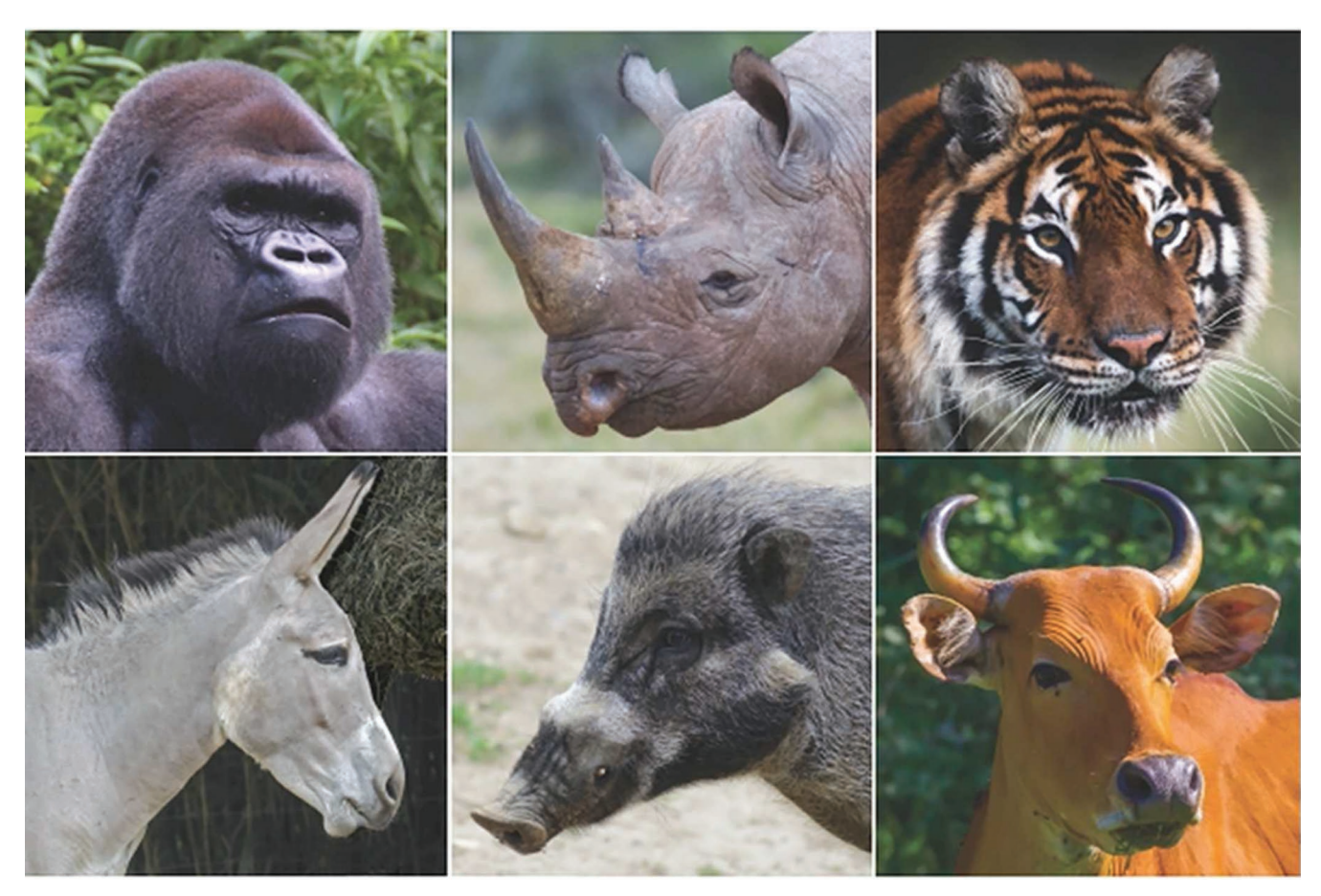
Figure 2. Photographic examples of threatened megafauna. Top row left to right: photos of well-known species, including the Western gorilla (Gorilla gorilla) (CR), black rhino (Diceros bicornis) (CR), and Bengal tiger, (Panthera tigris tigris) (EN). Bottom row left to right: photos of lesser-known species, including the African wild ass (Equus africanus) (CR), Visayan warty pig (Sus cebifrons) (CR), and banteng (Bos javanicus) (EN).

imperiled (tables S1 and S2). Most of the world's megaherbivores remain poorly studied, and this knowledge gap makes conserving them even more difficult (Ripple et al. 2015).