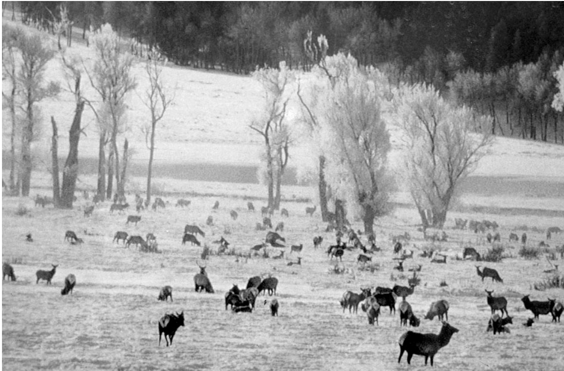
Figure 2. Elk browsing among cottonwood trees in the wintertime along the Lamar River in the northern range of Yellowstone National Park during the period when wolves had been extirpated. Note the lack of recruitment of small and intermediate-sized cottonwood trees that has occurred over many decades and the general lack of vigilance indicated by the elk.

continued until the present, with data missing for some years. With the removal of predation and associated predation risk effects following the extirpation of wolves, elk in the northern range had a significant impact on the recruitment of deciduous woody species. As a consequence, recruitment of upland aspen and riparian cottonwood soon crashed (figure 1c). This loss of recruitment continued over multiple decades, even though sport hunting of elk occurred each winter when some of the elk left the park, and park administrators deliberately sought to reduce the elk population from the mid-1920s to 1968 (figure 1b).