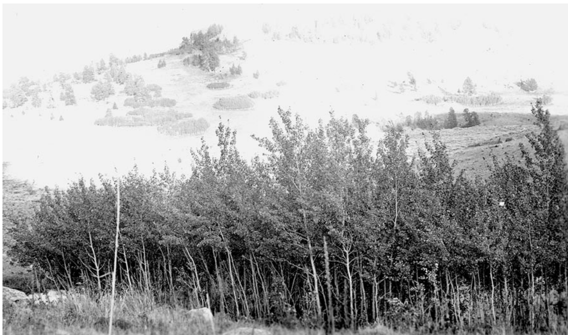
Figure 3. Photograph taken in 1900 near Tower Junction on the northern range of Yellowstone National Park, showing evidence of elk browsing on the outer stems of a 3- to 5-meter-tall aspen thicket in the foreground and multiple aspen thickets on a distant hillslope (Meagher and Houston 1998). We hypothesize that dense regeneration after wildfire resulted in high levels of predation risk in the interior of aspen thickets; thus, browsing is evident only along the outer edges of the thicket. Even following the widespread fires of 1988, such aspen thickets are not common on the northern range.

represented hunting kills outside the park. Seasonal sport hunting just outside the park boundary may have caused some elk to remain within the park instead of following former down-valley migrations (Barmore 2003). However, by the late 1960s, when the elk population had been reduced, recruitment of woody browse species did not occur (figure 1c).