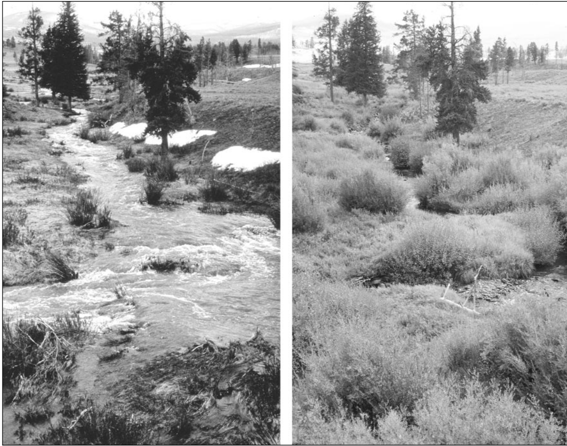
Figure 6. Willow along Blacktail Creek in spring 1996 (left) and summer 2002 (right). Following a 70-year period of wolf extirpation, heavy browsing of willows and conifers is evident in the 1996 photograph. In 2002, after 7 years of wolf recovery, willows show evidence of release from browsing pressure (increases in density and height).