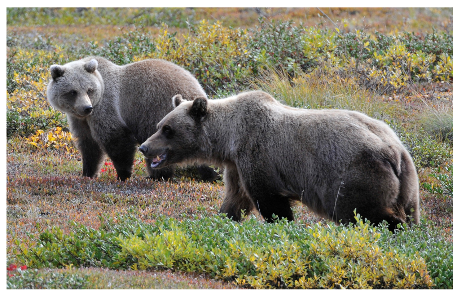
Fig 1. Alaskan brown bears in Denali National Park.

https://doi.org/10.1371/journal.pbio.3000090.g001