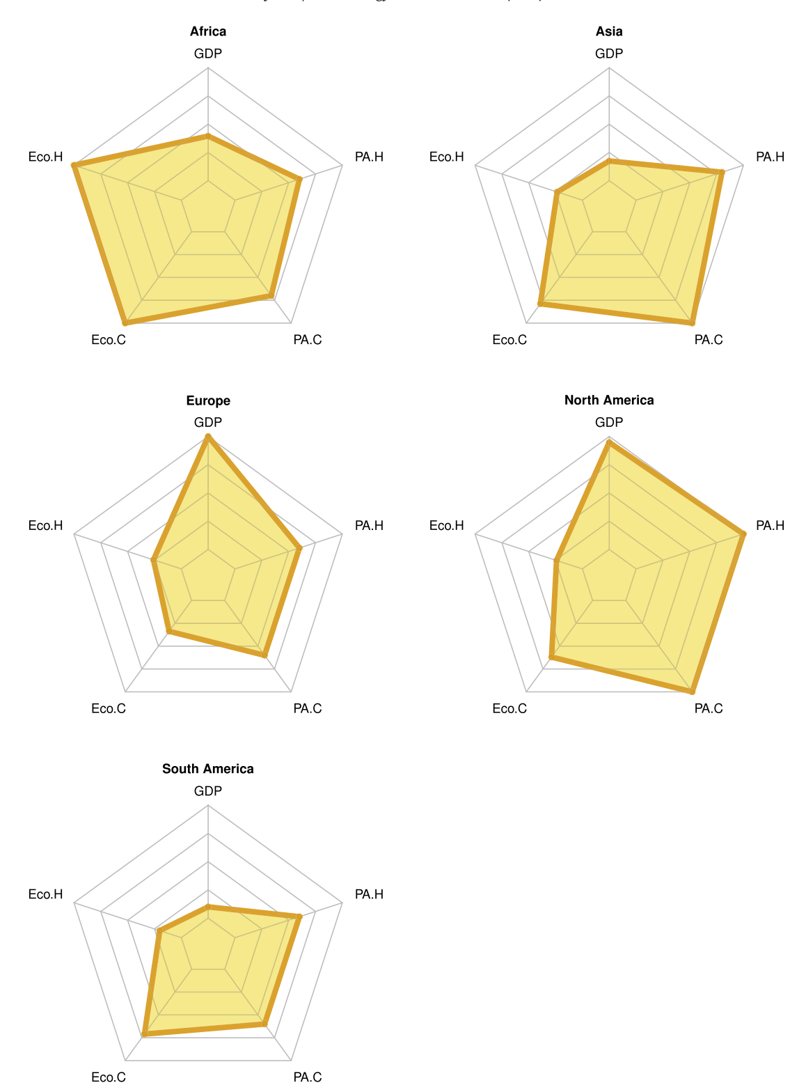
Fig. 3. Relative importance of the ecological (herbivores: Eco.H, carnivores: Eco.C), protected area (herbivores: PA.H, carnivores: PA.C), and financial (GDP) components in the Megafauna Conservation Index scores of.

support for conservation in other countries. Some countries have vast protected area networks and significant populations of megafauna, but limited means to protect them. The top performing countries in our analysis, such as Botswana, Tanzania